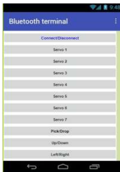
Fig.3: UI of the Android Application

The servo motors are connected to the digital pins of the microcontroller arduino uno. The Tx and Rx pins of the Bluetooth module HC-05 are connected to the Rx and Tx pins of the arduino uno respectively. The servo motors SG90 are connected to the arm using strings. The servo motors are powered using an external 6V power supply which is achieved by a voltage divider network. The program is compiled and uploaded to the board using Arduino IDE software. The android application has 7 buttons for the independent movement of all the 7 servo motors. It has a pick/drop option for a complete grip. The up/down option gives a vertical movement of the hand and the left/right button for the horizontal movement.